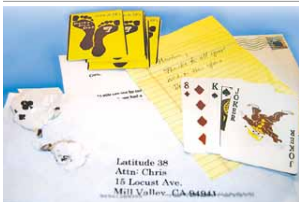
'Annie's winning hand and 'Endless Summer's lowball hand (a four of clubs that went swimming) from the season-long poker run. Prizes were souvenir decks of cards.

The drawbridge on the Turner Cut, just south of Tiki Lagun, was broken the morning we were to pass through, which meant a longer way around to Mildred Island. This was not a big deal, but it taught us to check ahead for bridge closures. We spent much of the follow-